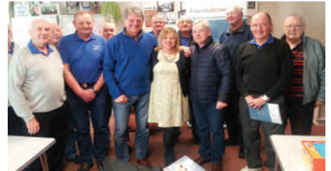
Thanks to Cardenden Mens Health Club