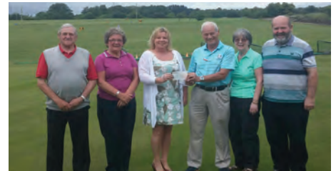
Thanks to Cluny Clays Golf Club